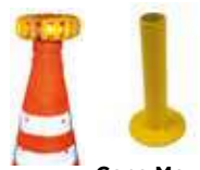
Cone Mount SPPULSARMAG